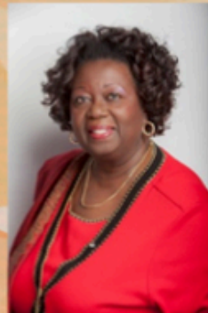
HON. DR. JEAN AUGUSTINE